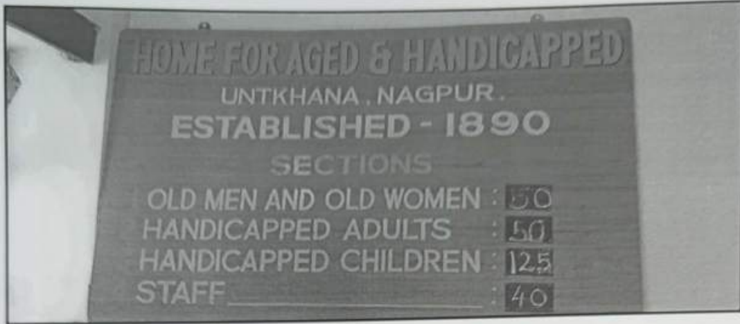
Visit to charitable trust "Home for Aged and Handicapped, Untkhana, Nagpur"