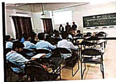
CRT CLASSES ENGAGE BY TRAINER