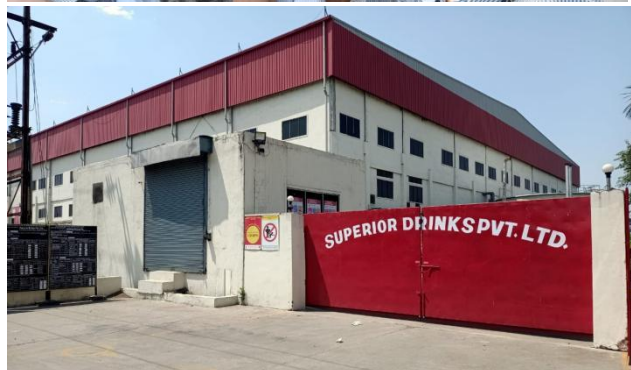
Industrial Visit to "Superior Drinks Pvt. Ltd", Butibori, Nagpur