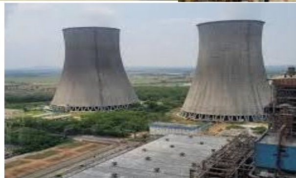
Koradi Thermal Power Station (KTPS), Nagpur