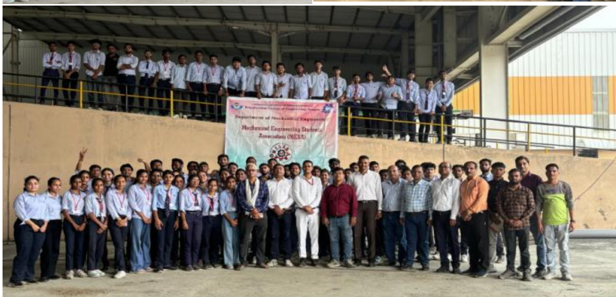
PATANJALI FOOD & HERBAL PARK NAGPUR