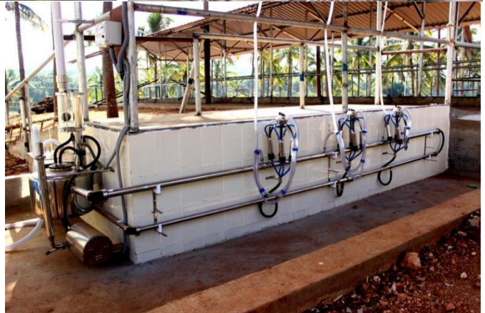
Dinshaw's Dairy Foods Pvt. Ltd, Butibori MIDC, Nagpur