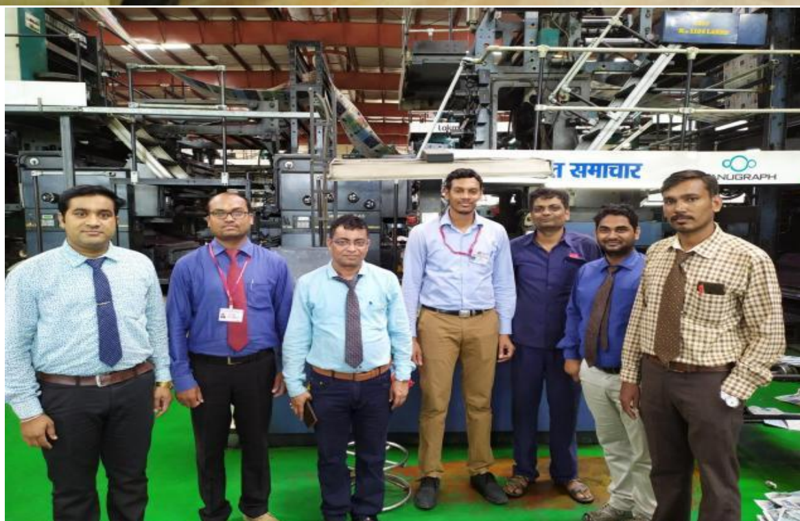
Lokmat Press Ltd, Butibori MIDC, Nagpur