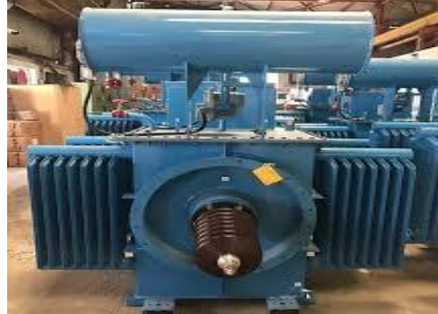
TRT Technologies, Mihan, Nagpur