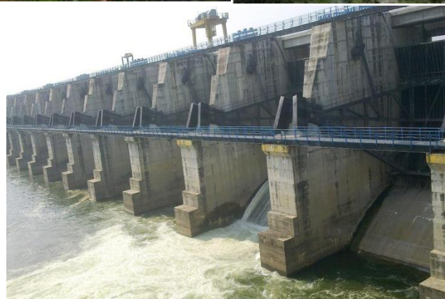
Gosi-khurd Irrigation Project, Bhandara