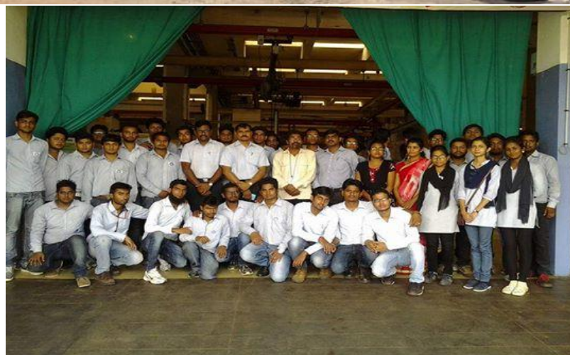
Mahindra & Mahindra Ltd, Hingna MIDC, Nagpur