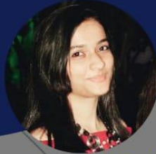
Yashasvi Patha Placed in :- 1) Global Logic Hitachi 2) Infosys 3) Tudip Technologies 4) Quality Kishok